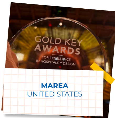
MAREA UNITED STATES