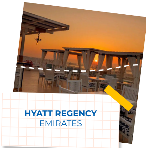
HYATT REGENCY EMIRATES