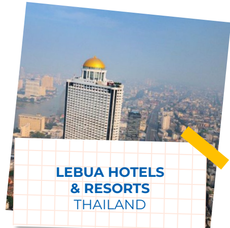
LEBUAH HOTELS & RESORTS THAILAND