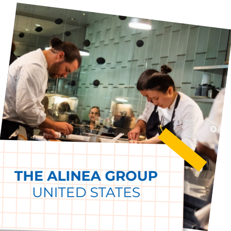
THE ALINEA GROUP UNITED STATES