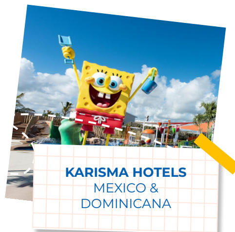
KARISMA HOTELS MEXICO & DOMINICANA